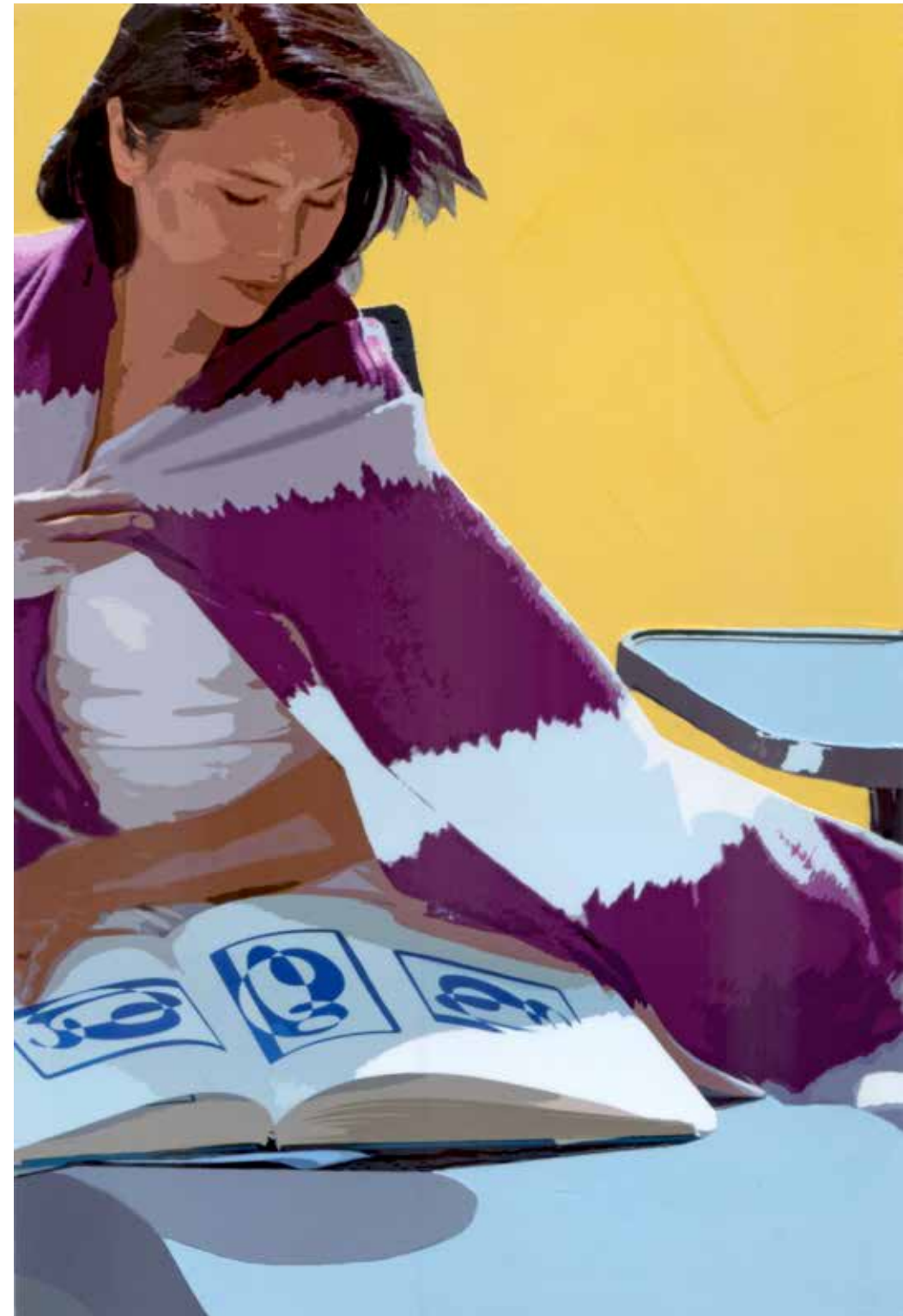
Contrapposto 2017 Mixed Media Collage 9 x 6 inches

The freedom of previous choices also becomes The predicate for the next transition.