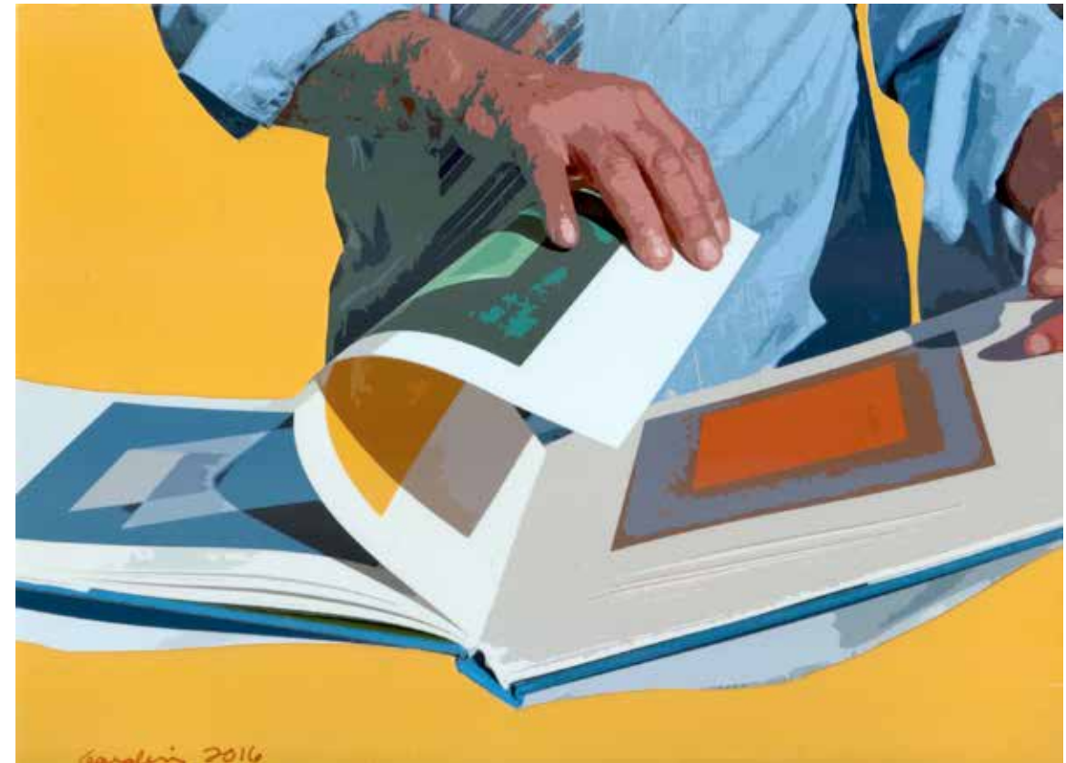
Float 2016 Mixed Media Collage 6.4 x 8.8 inches

Naples, cadmium, arylide, barium, strontium, ochre, sienna, Cobalt, Indian, yellows all as distinct and physical a presence As a curry, mustard seed or crocus stamen.