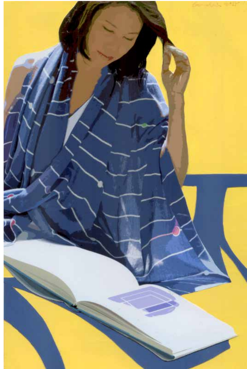
Isocetes 2017 Mixed Media Collage 9 x 6 inches

A touch of ivory black lent solidity to light ultramarine And made it modernly blue.