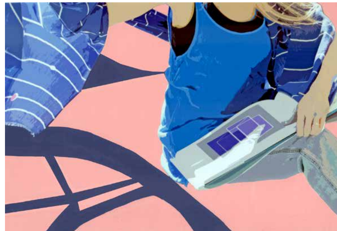
Interstices 2017 Mixed Media Collage 6 x 9 inches

Energy and imagination bridges the gap between structures Like thoughts themselves, imbuing them with intent.