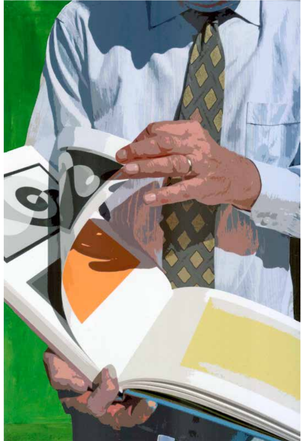
Go 2016 Mixed Media Collage 9 x 6 inches