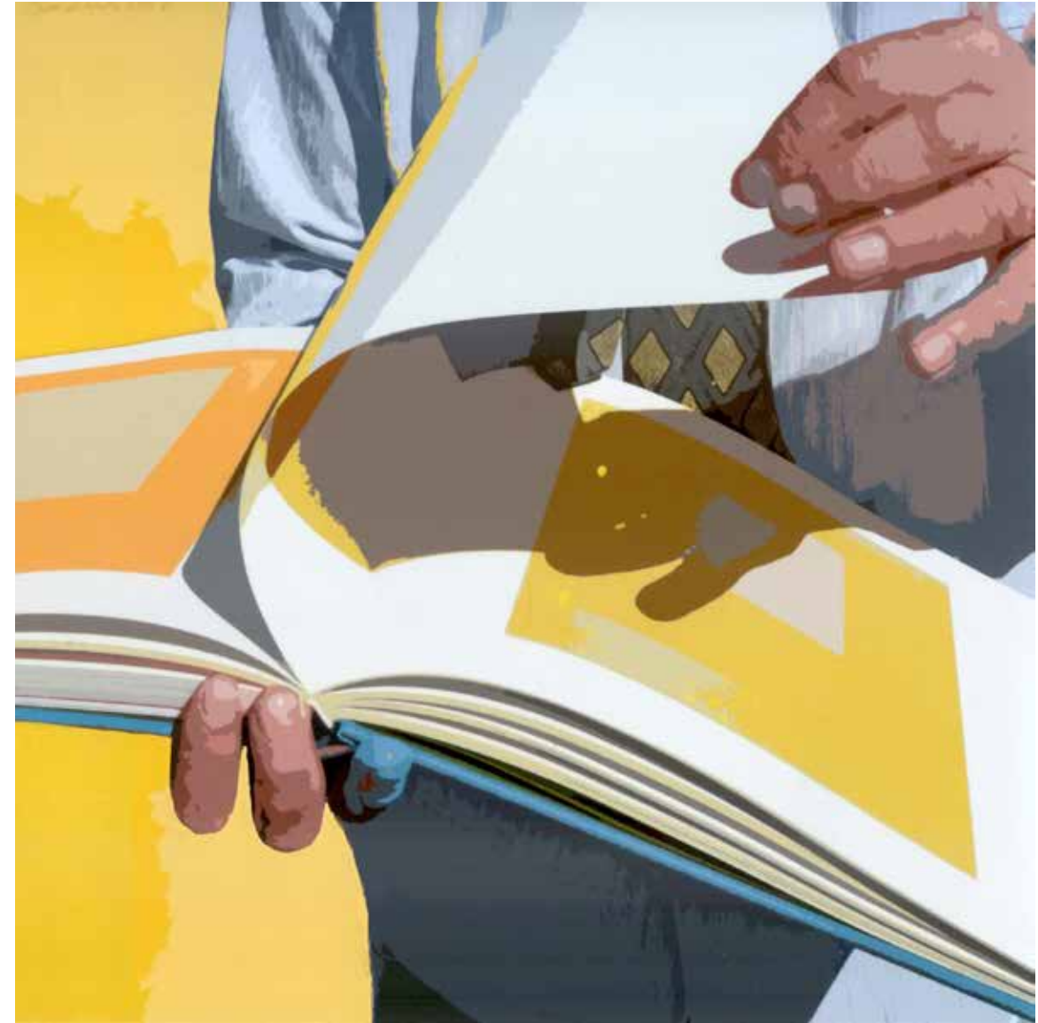
Yellow Curve 2016 Mixed Media Collage 7.5 x 7.5 inches

Geometry, form or ground can be as dependent And subjective as any equation.