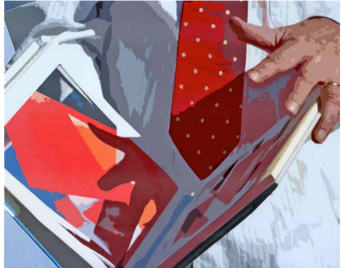
Project 2016 Mixed Media Collage 7 x 9 inches