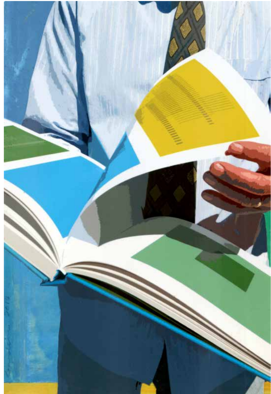
Blue and Green 2016 Mixed Media Collage 9 x 6 inches

It can stand as tranquil as a tree or windless pond.