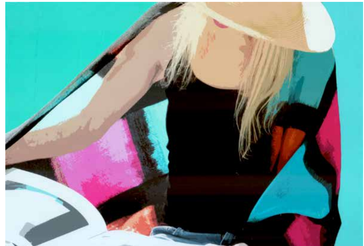
Variant Five 2017 Mixed Media Collage 6 x 9 inches

Shocking as a cyclone I hadn't thought of until encountered.