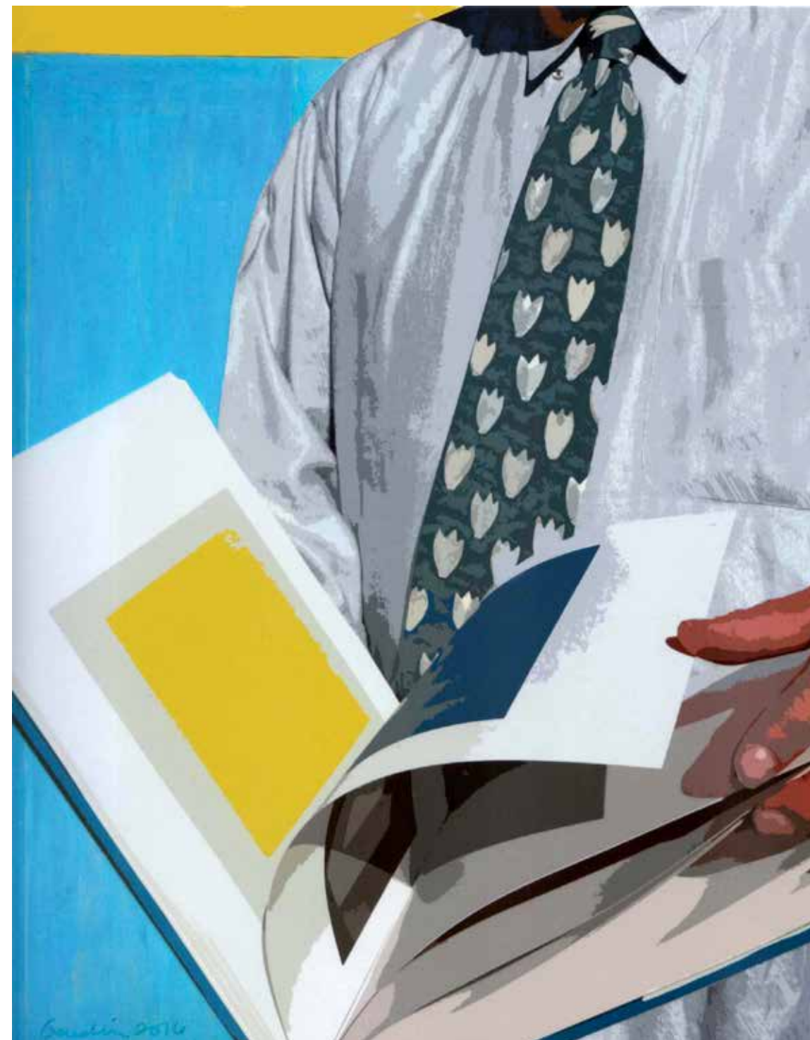
Curtain Wall 2016 Mixed Media Collage 9 x 7 inches

Like Spring always gains the support of an empty palette.