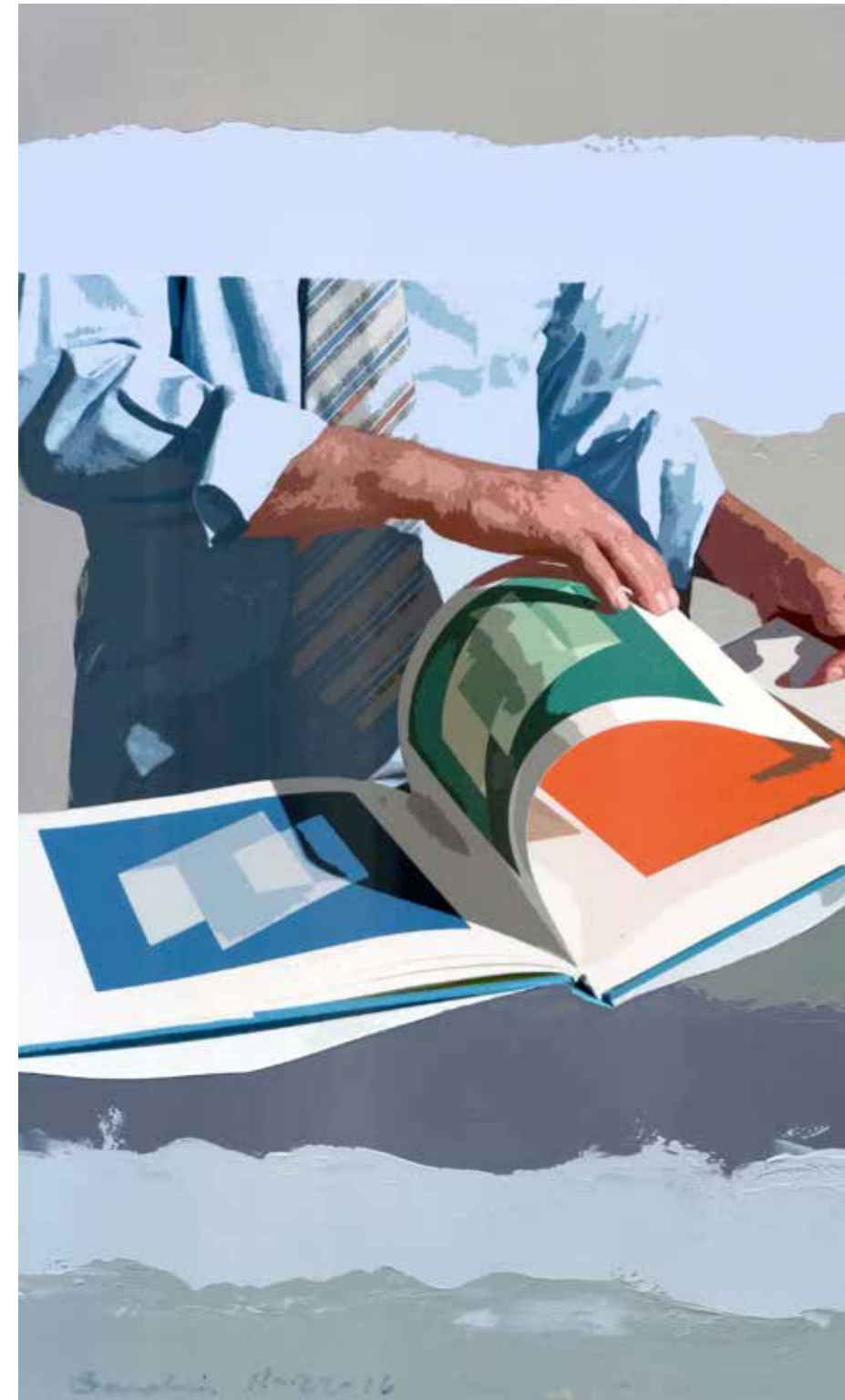
Window 2016 Mixed Media Collage 9.75 x 5.75 inches

Or it can inhabit a world in its own image.