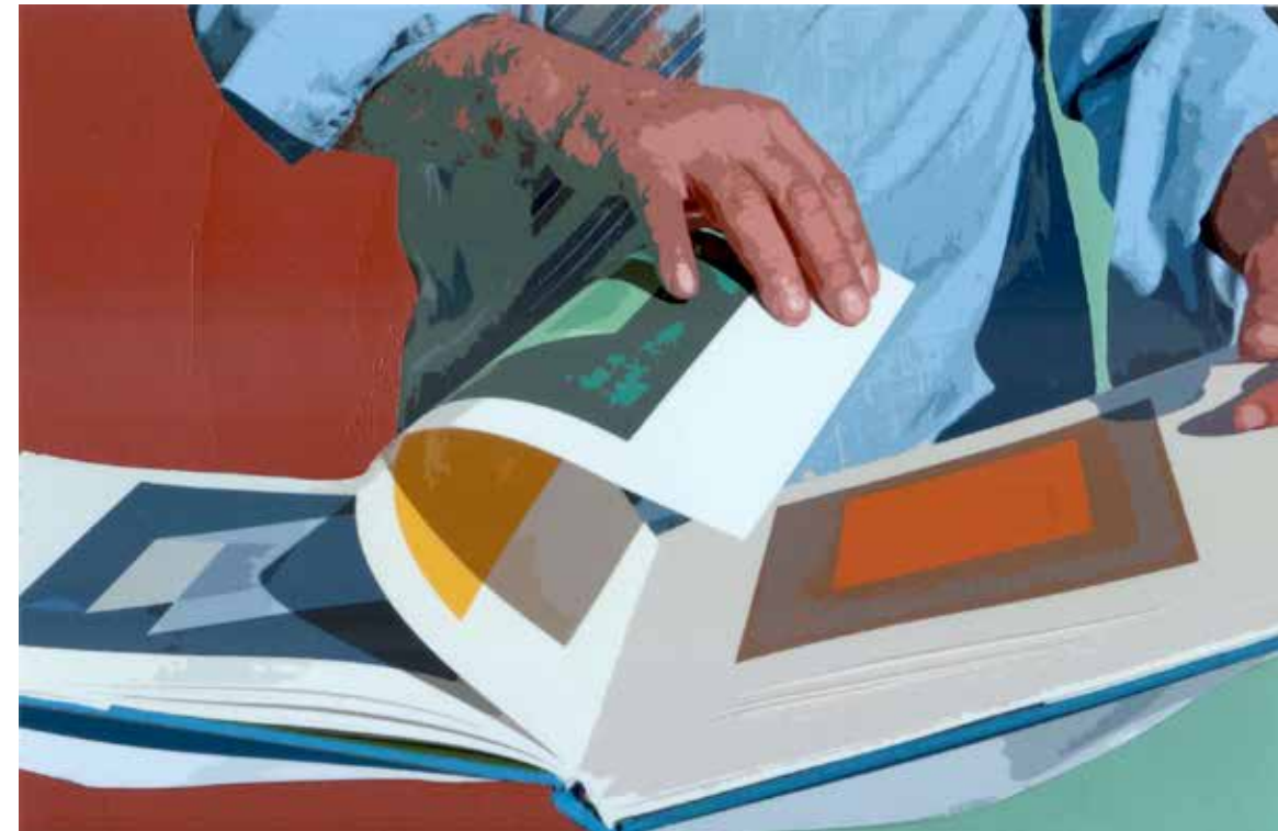
Red Earth 2016 Mixed Media Collage 4 x 6 inches

Or spatial planes and negative space as decisive As the sharp hiss of a consonant.