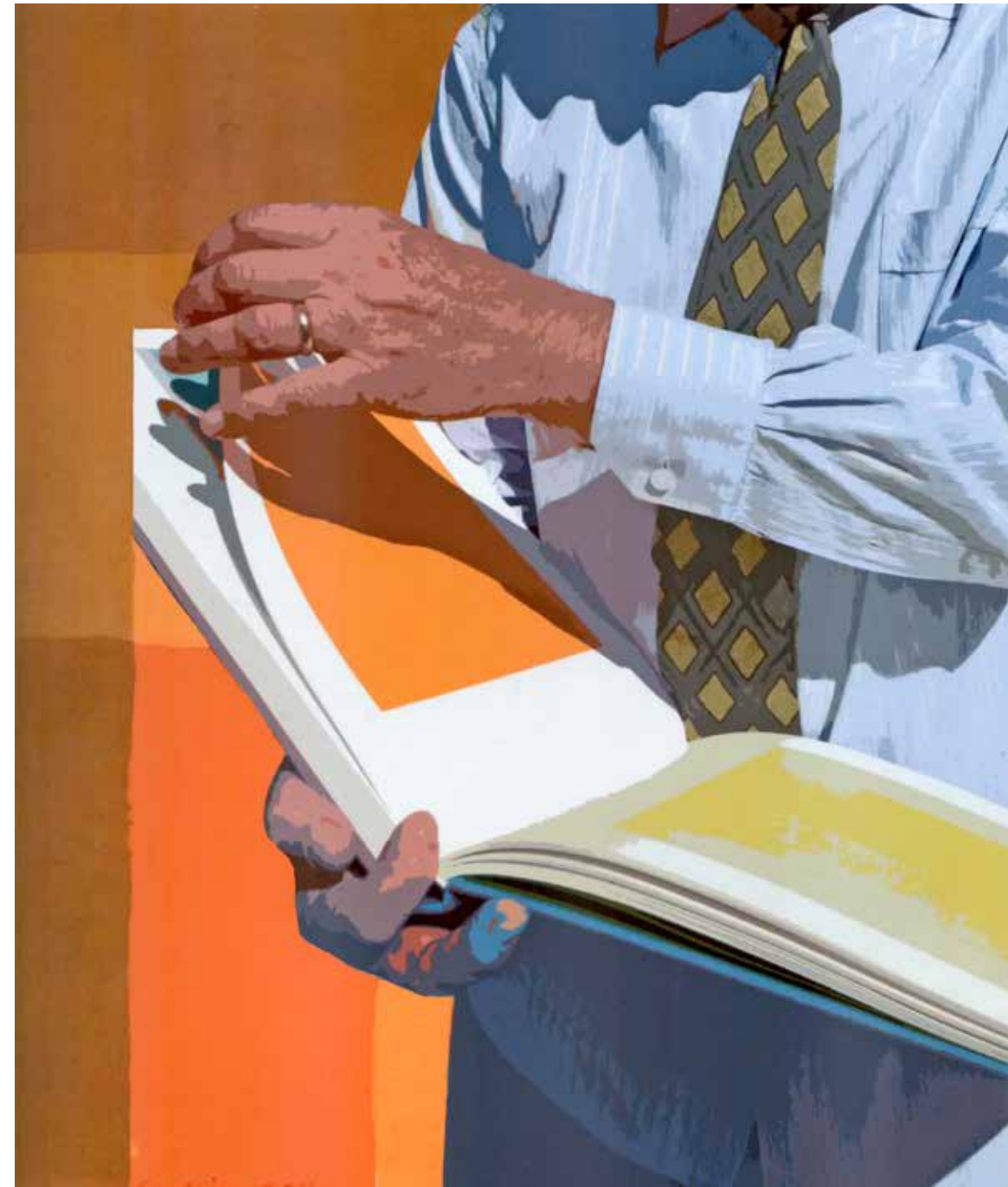
Pleat 2016 Mixed Media Collage 9 x 7 inches

Fall reveals what was there all along, unnoticed.