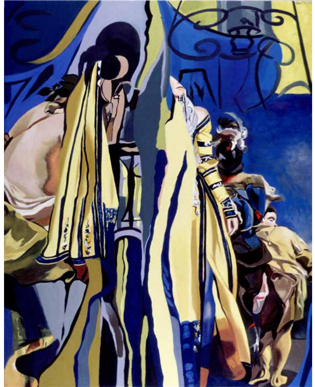
Journey 60" x 48" Oil on Canvas 1999