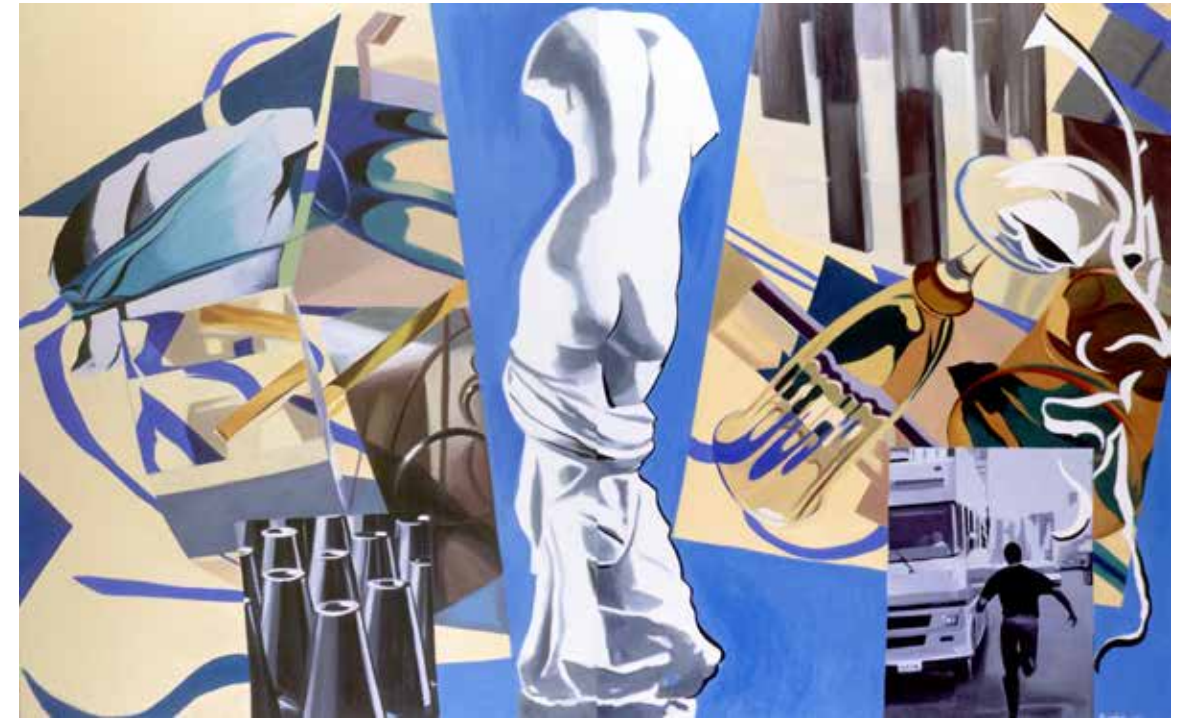
About New York 60" x 96" Diptych Oil on Canvas 1996