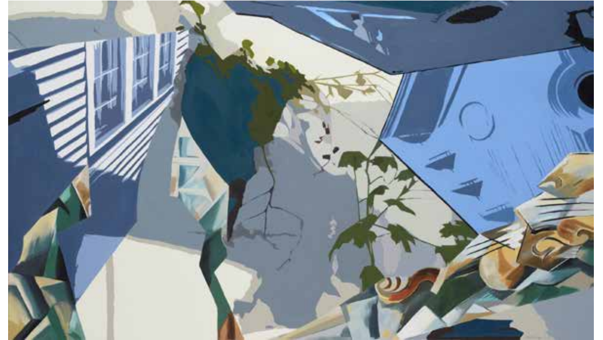
Blue Corbels 36" x 60" Oil on Canvas 2011