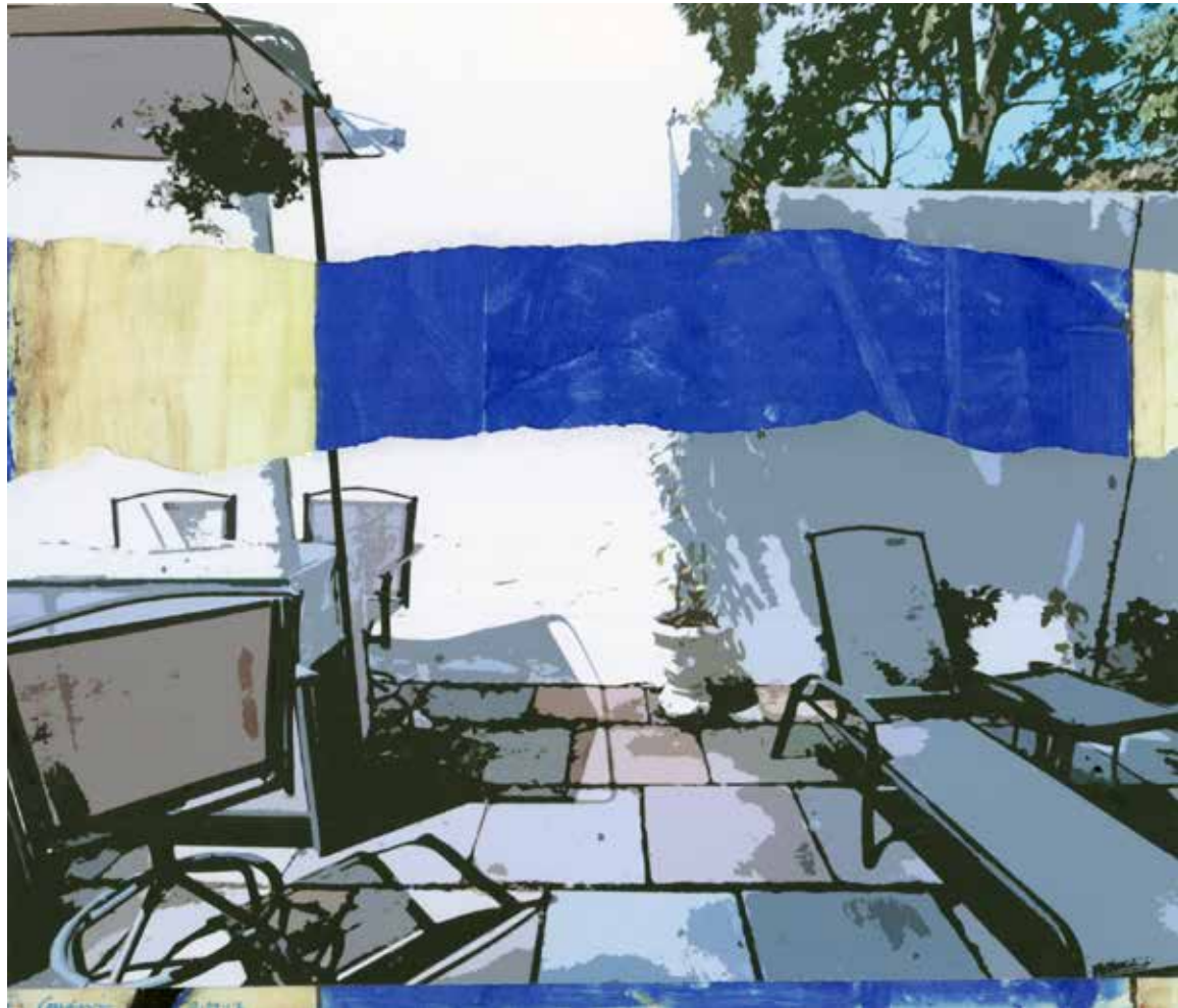
Study for Blue Stripe 8.25" x 9.5" Collage 2014