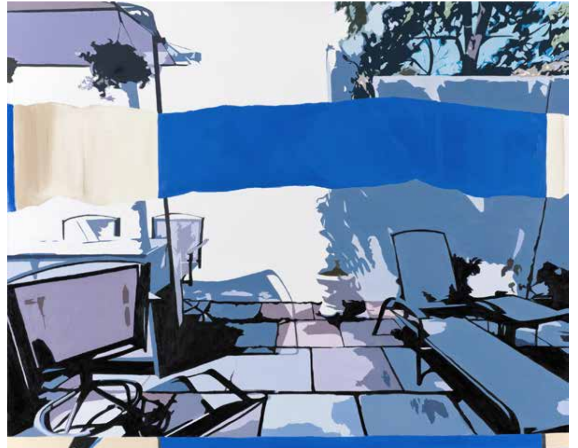
Blue Stripe 40" x 50" Oil on Canvas 2015