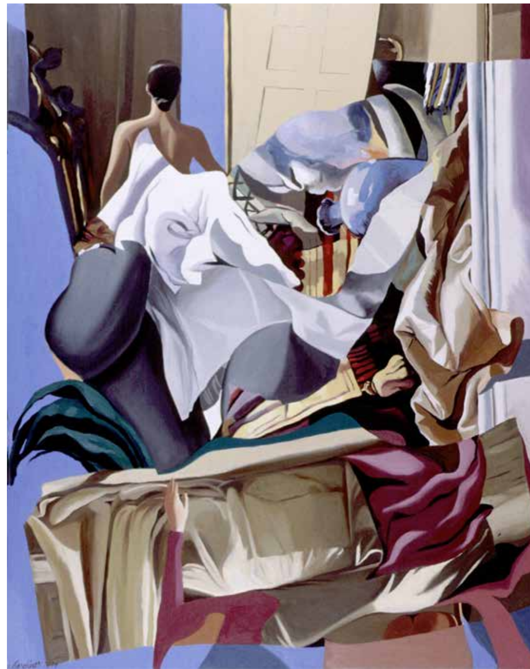
Opera Prima 60" x 48" Oil on Canvas 1999