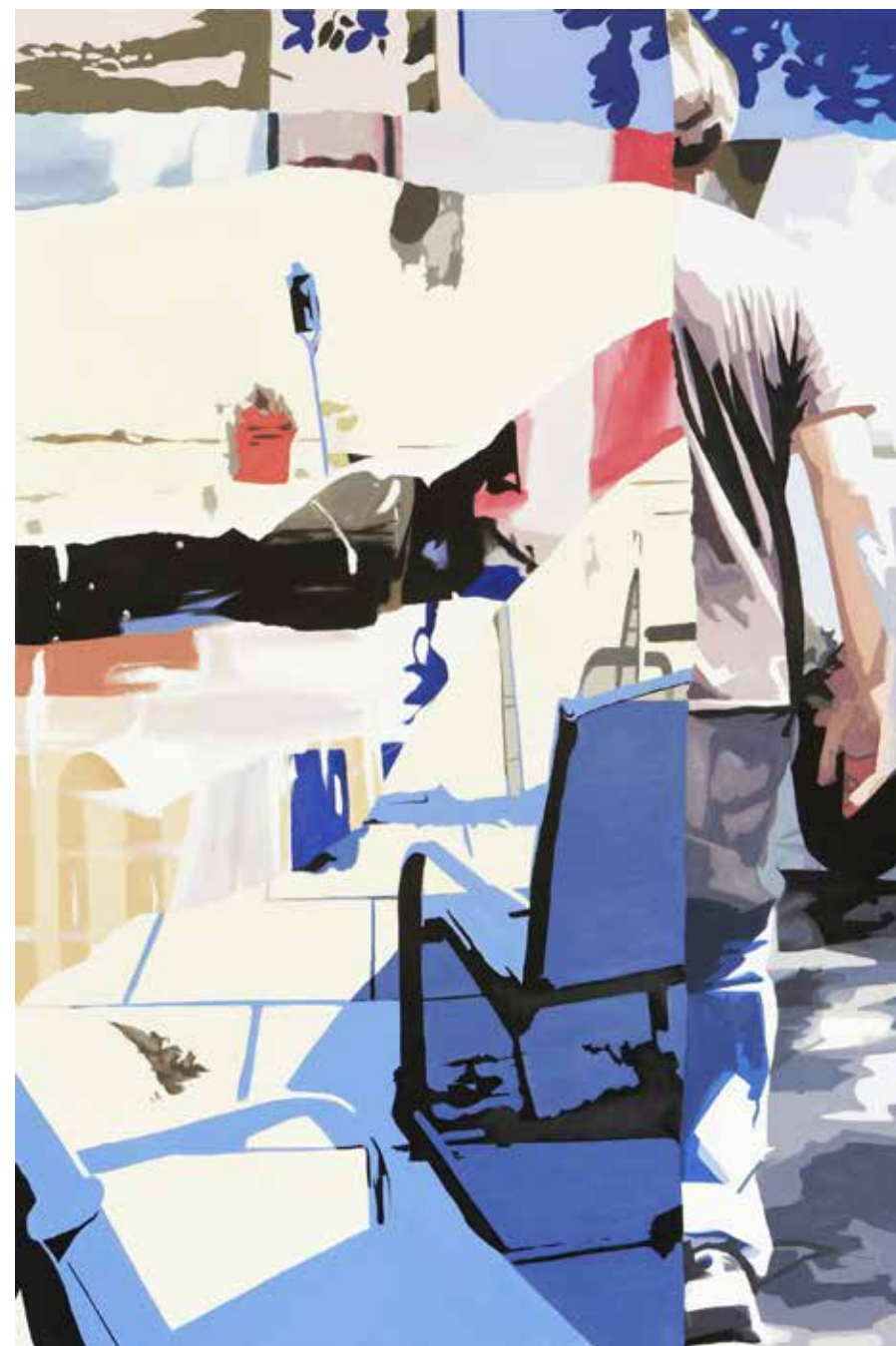
August 60" x 40" Oil on Canvas 2012