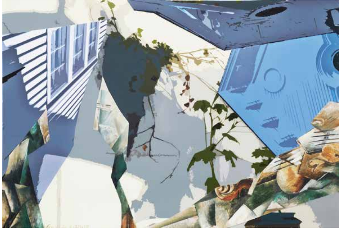
Study for Blue Corbels 6.75" x 10" Collage 2011