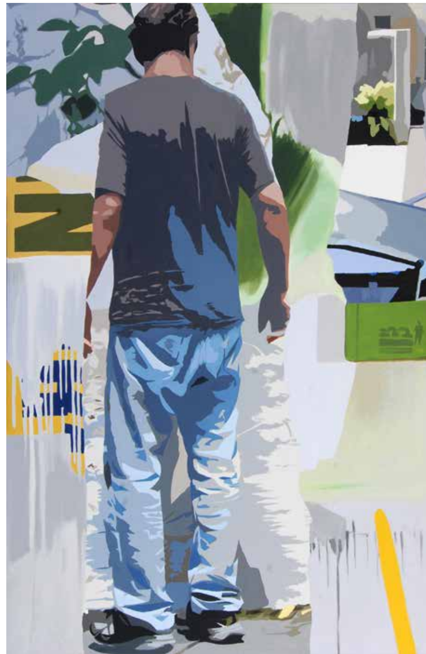
Barometer 60" x 40" Oil on Canvas 2012