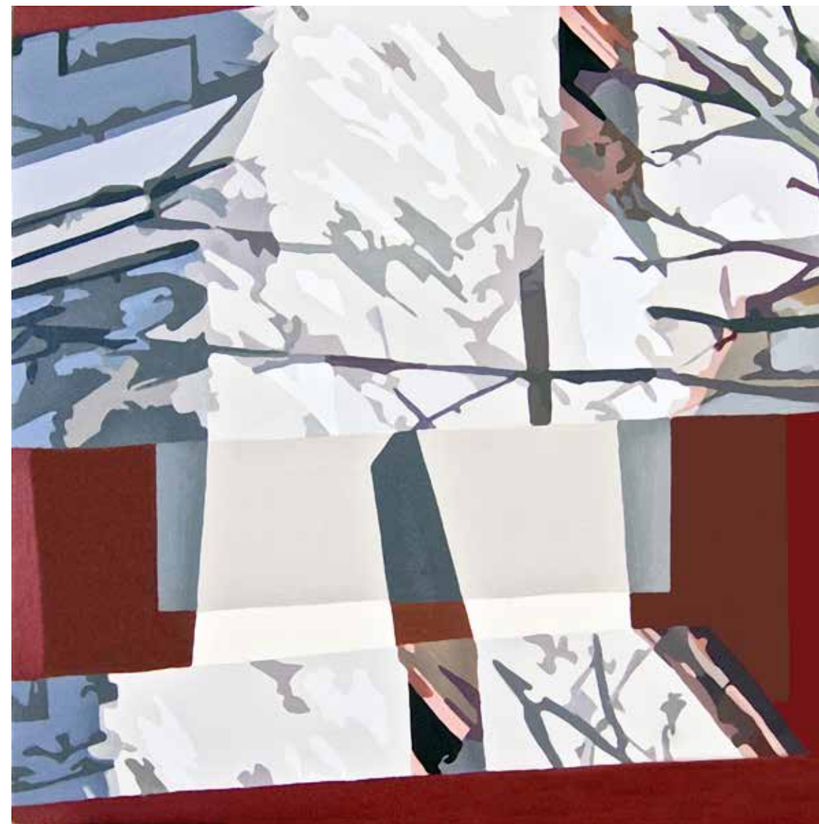
April 24" x 24" Oil on Canvas 2013