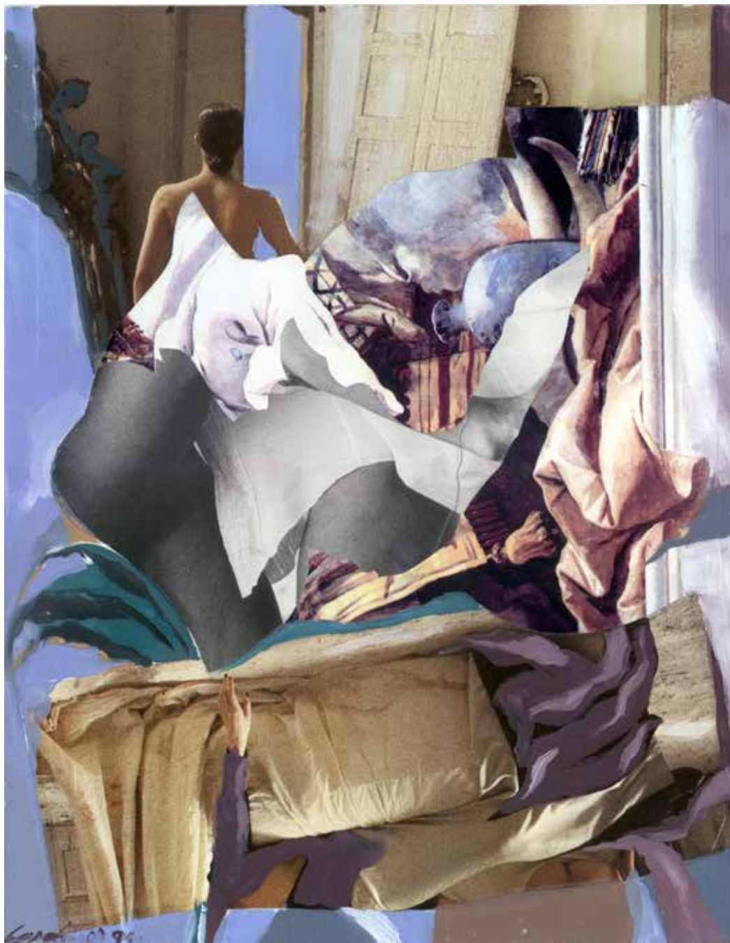
Study for Opera Prima 14" x 11" Collage 1999