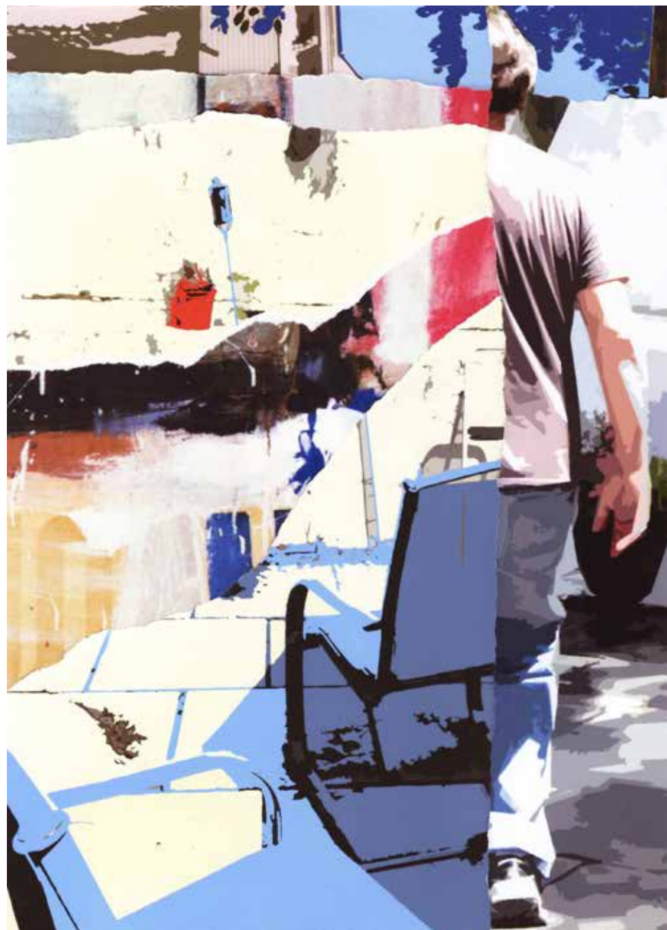
Study for August 9.3" x 6.8" Collage 2011