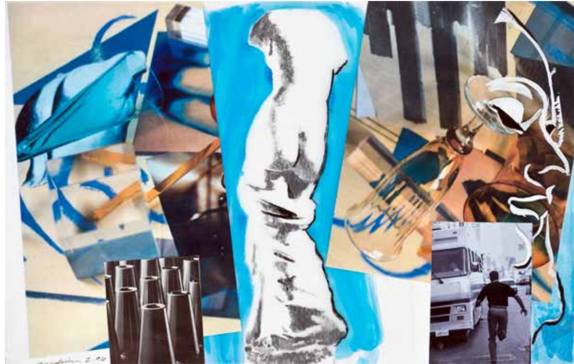
Study for About New York 10" x 16" Collage 1996