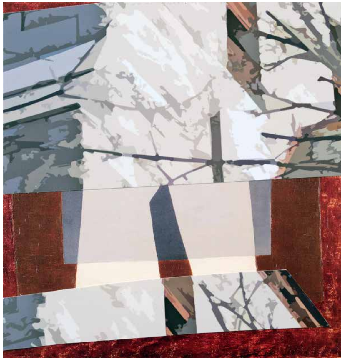
Study for April 6.4" x 6.75" Collage 2012