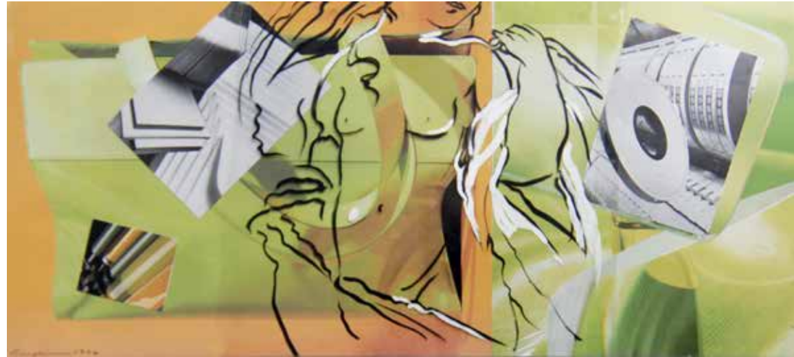
Study for Is This The Place? 7.75" x 17.25" Collage 1996