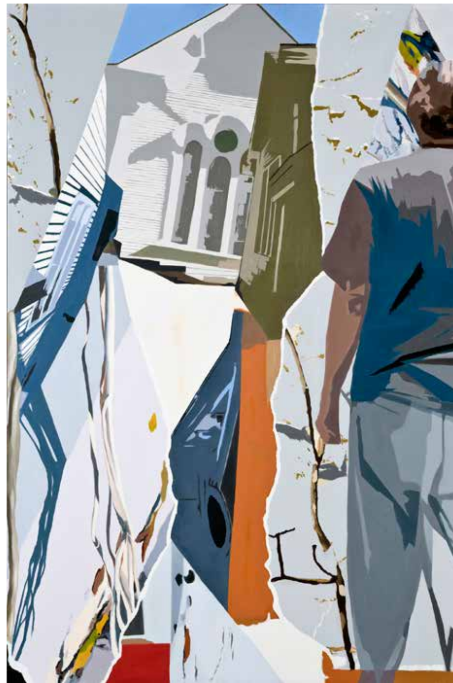
La Farge 60" x 40" Oil on Canvas 2011