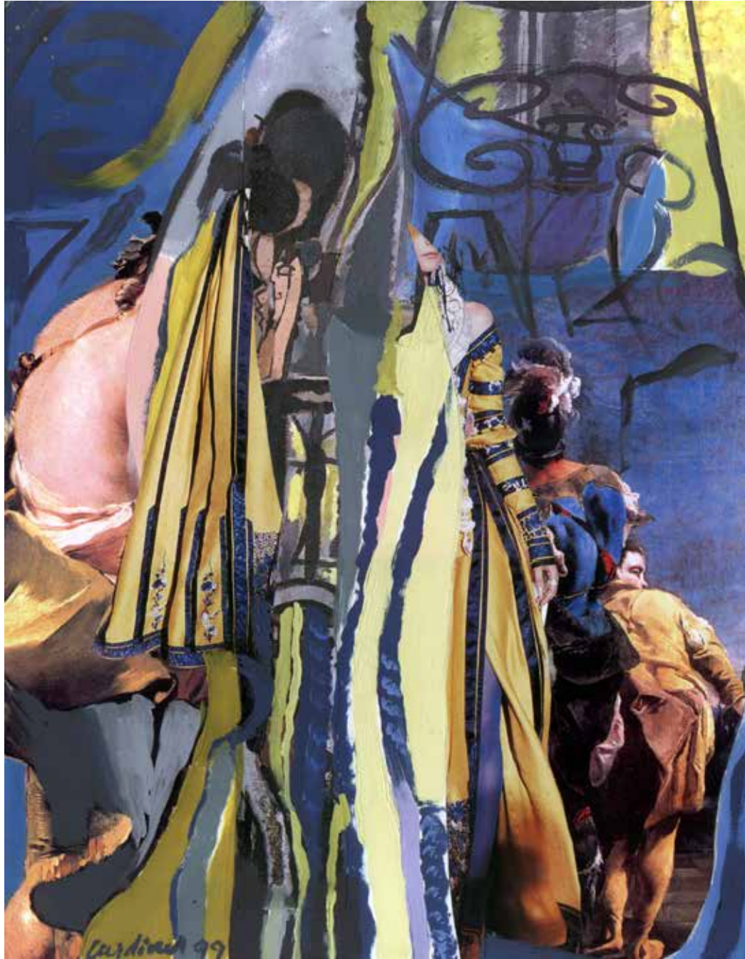
Study for Journey 14" x 11" Collage 1999