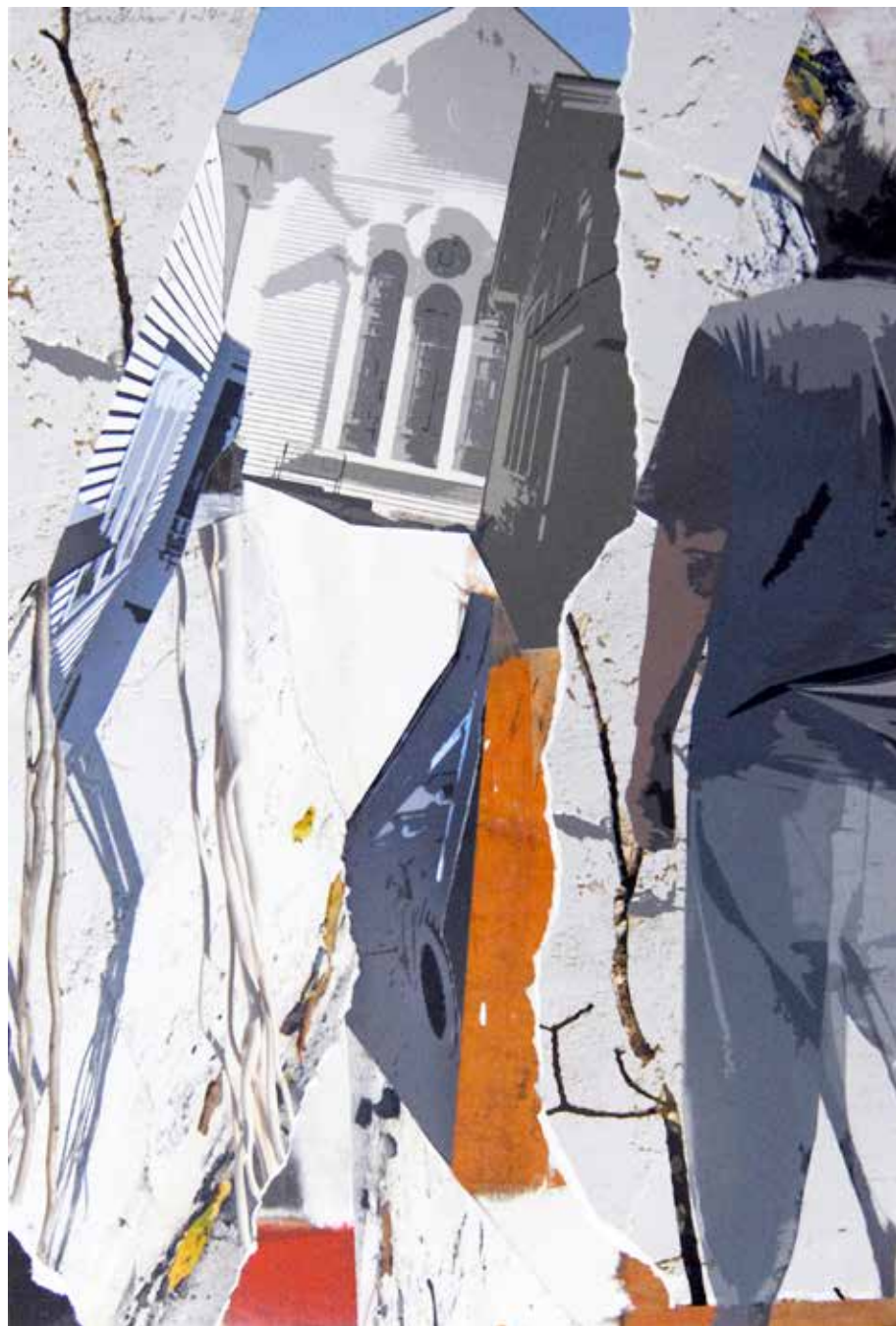
Study for La Farge 9" x 5" Collage 2011